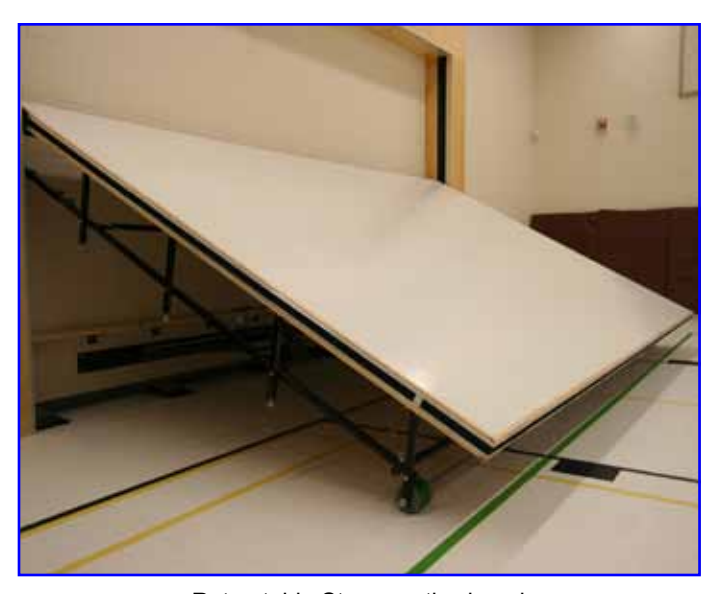
Retractable Stage partly closed